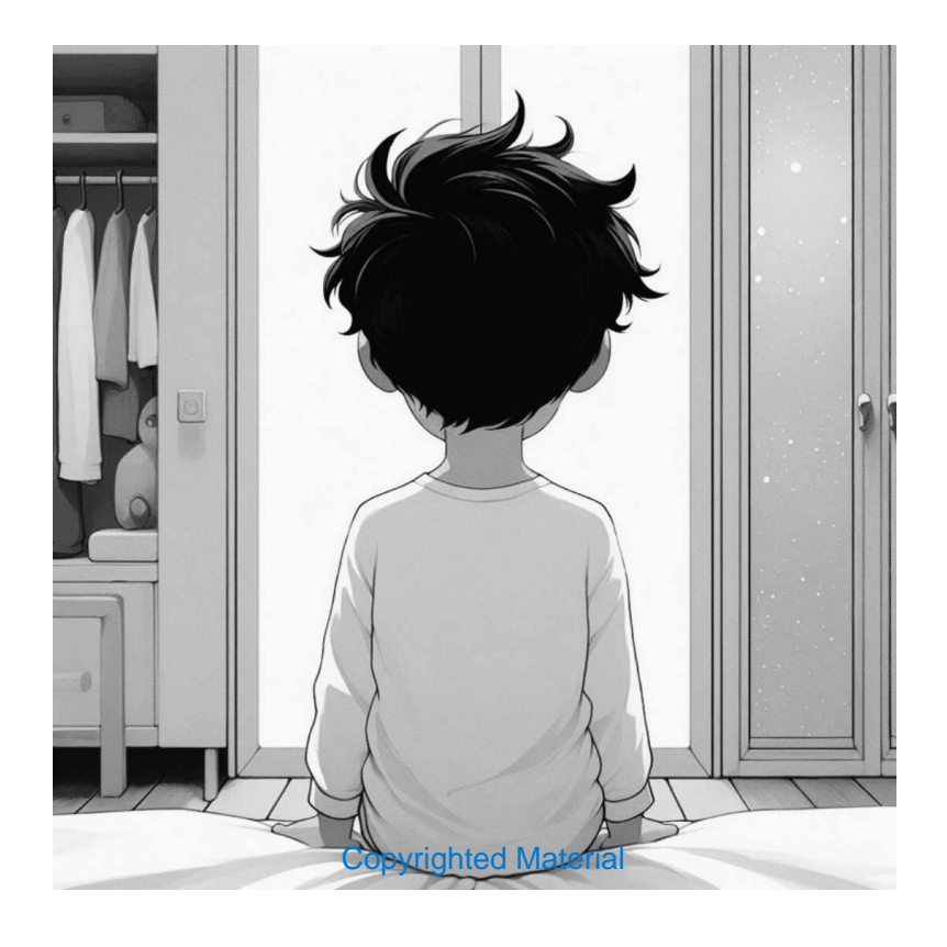
"The future is unknown so is your potential." -Unknown